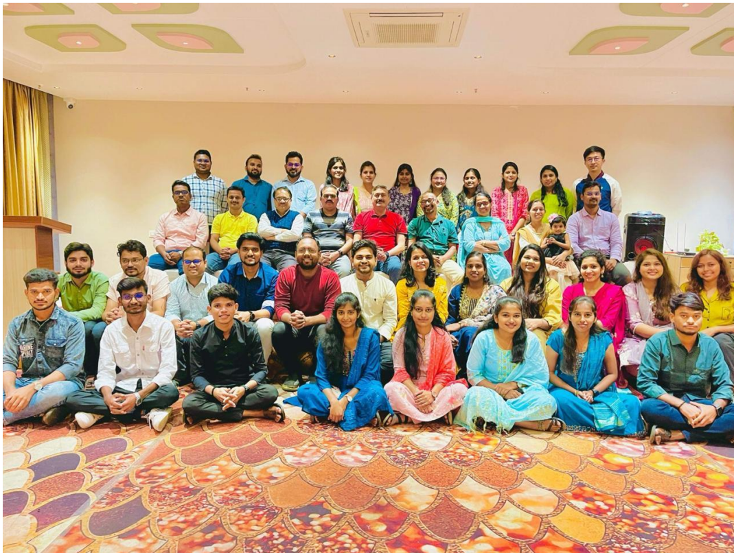
Picture : Departmental Celebrations