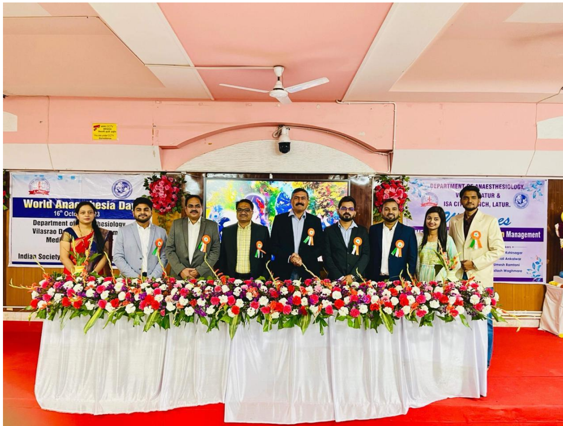
Picture : CME on Chronic Pain Management - 2023