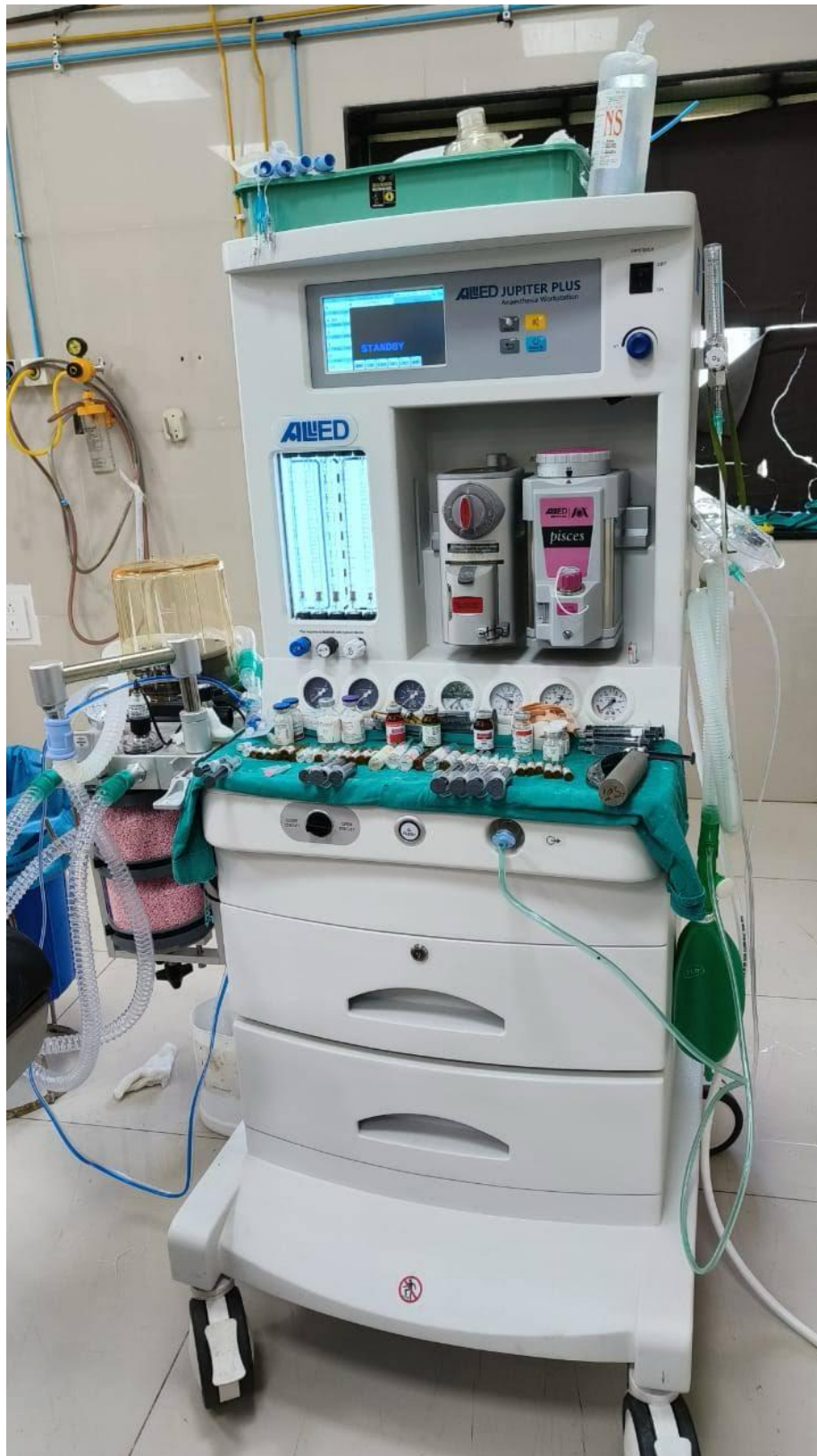
Picture : Workstation