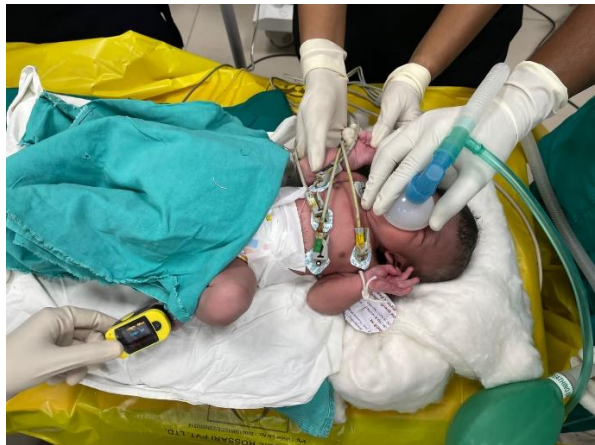
Picture: OT Procedures