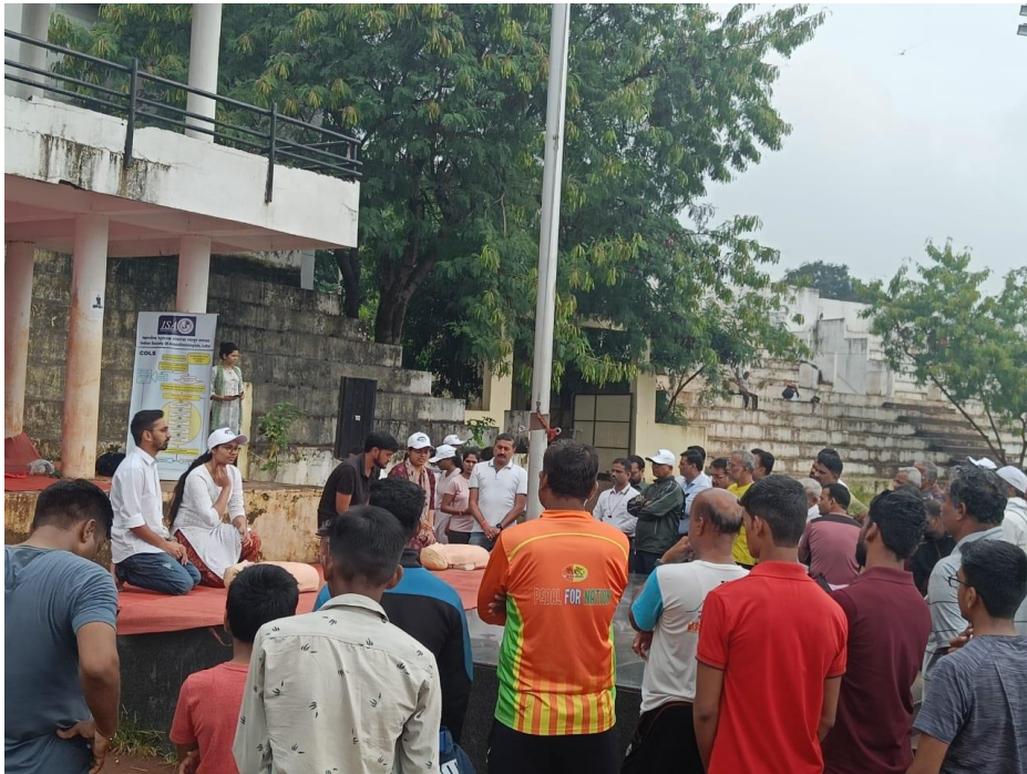
Picture : CPR Demonstration