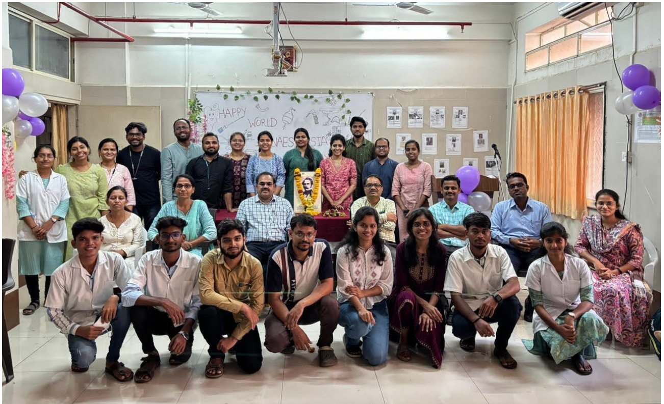
Picture : Departmental Gatherings