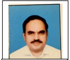
Paste colour passport Size Photograph (3.5x4.5 cm)