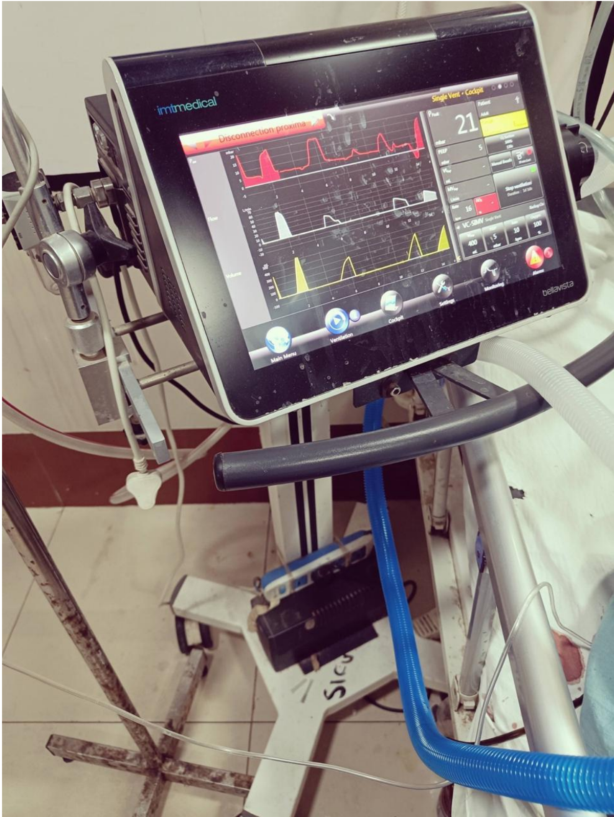
Picture : Ventilator