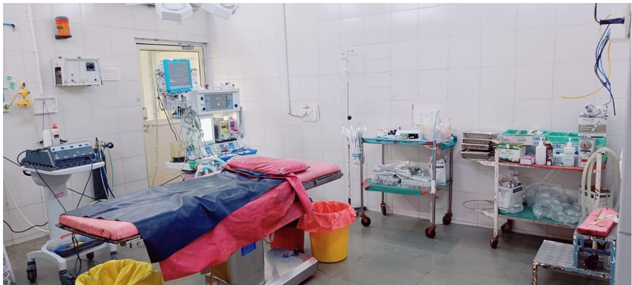
Picture : Operation Theatre